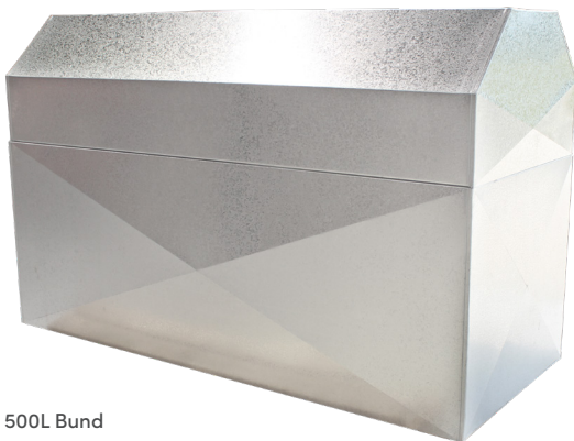
— 500L Bund

Refer to your local council for diesel tank and bund requirements.