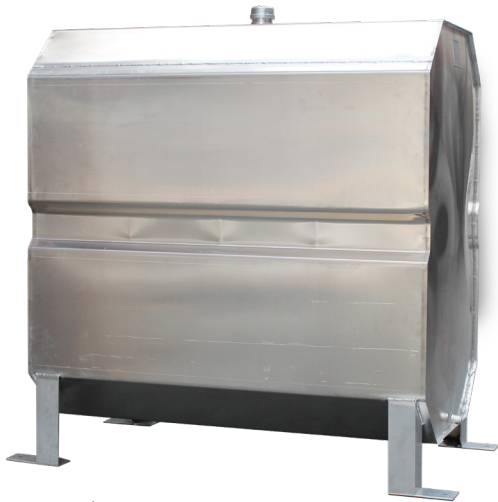
— 1000L Tank