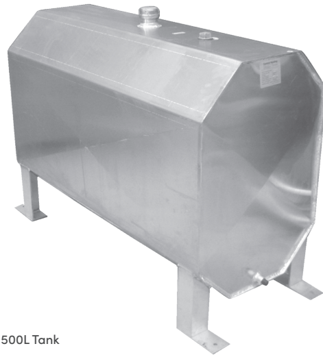
— 500L Tank